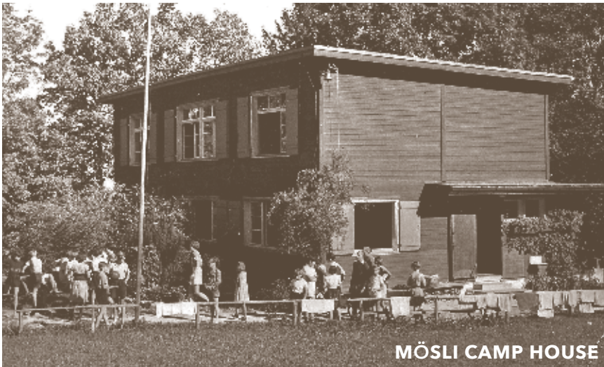
MÖSLI CAMP HOUSE