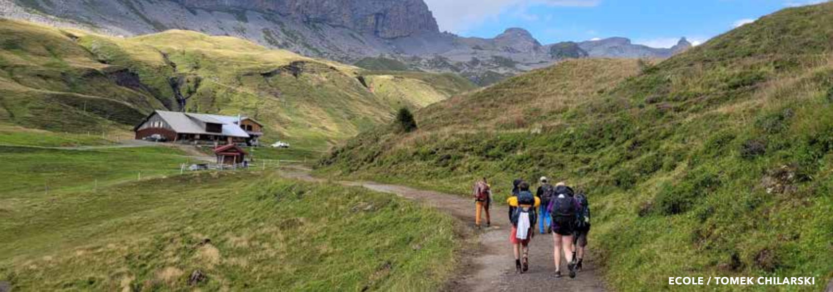
ECOLE / TOMEK CHILARSKI